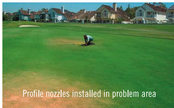
Profile nozzles installed in problem area

Use less water, less energy and less manpower and get better course playability