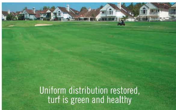
Uniform distribution restored, turf is green and healthy