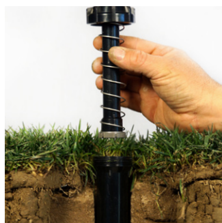
Remove existing sprinkler